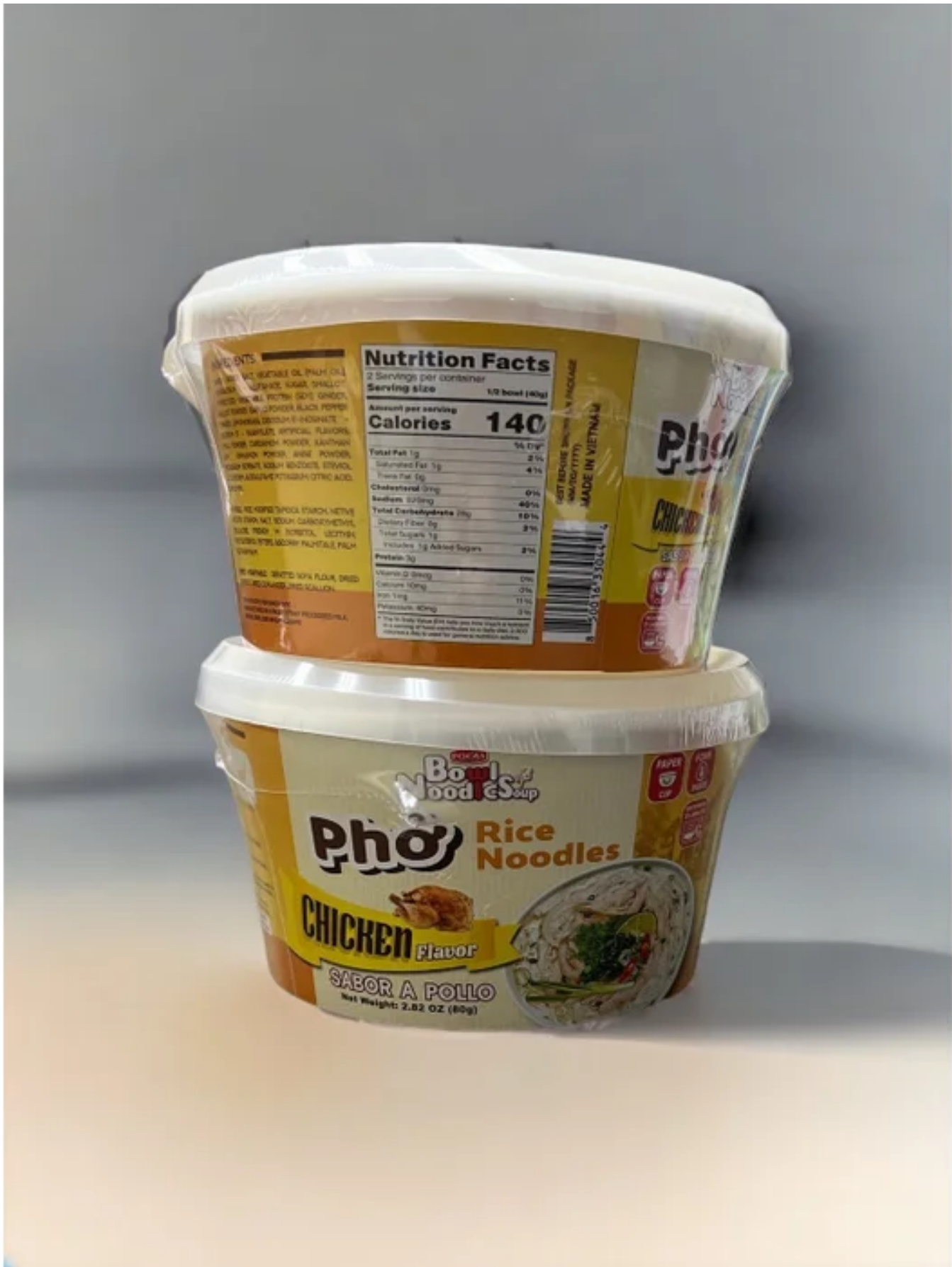
CHICKEN&RICE NOODLE SOUP 12/3.17OZ