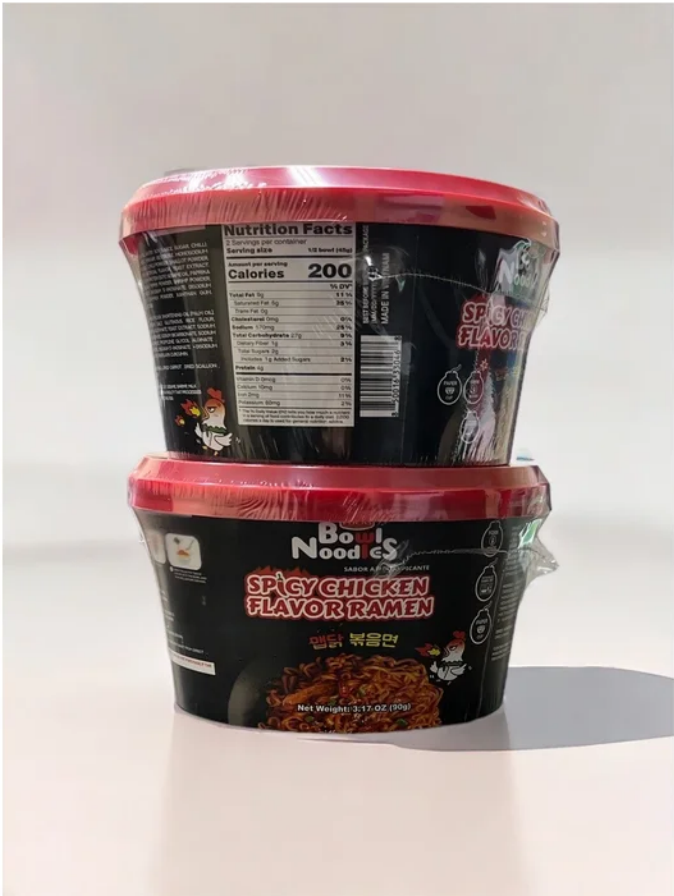
SPICY CHICKEN FLAVOR RAMEN 12/3.17OZ